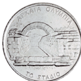
ANCIENT OLYMPIA THE STADIUM

Metallic Composition: Copper 75% Nickel 25% Diameter: 28,50 mm Weight: 9,50 gr. Year of first issue: 2000