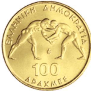
WRESTLING EVENT IN THE "RAM" HOLD POSITION

Metallic Composition: Copper 92% Aluminium 6% Nickel 2% Diameter: 29,50 mm Weight: 10 gr. Year of first issue: 1999