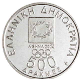
LOGO OF THE ATHENS 2004 OLYMPIC GAMES

Metallic Composition: Copper 75% Nickel 25% Diameter: 28,50 mm Weight: 9,50 gr. Year of first issue: 2000