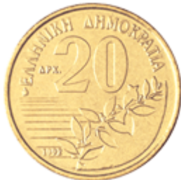
OLIVE TREE BRANCH

Metallic Composition: Copper 92% Aluminium 6% Nickel 2% Diameter: 24,50 mm Weight: 7 gr. Year of first issue: 1990