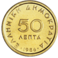
50 LEPTA HELLENIC REPUBLIC

Metallic Composition: Copper 79% Zinc 20% Nickel 1% Diameter: 18,00 mm Weight: 2,50 gr. Year of first issue: 1976