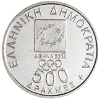
LOGO OF THE ATHENS 2004 OLYMPIC GAMES

Metallic Composition: Copper 75% Nickel 25% Diameter: 28,50 mm Weight: 9,50 gr. Year of first issue: 2000