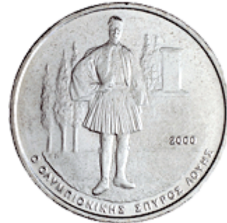
THE OLYMPIC CHAMPION SPYROS LOUIS

Metallic Composition: Copper 75% Nickel 25% Diameter: 28,50 mm Weight: 9,50 gr. Year of first issue: 2000