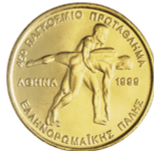
MODERN WRESTLING EVENT

Metallic Composition: Copper 92% Aluminium 6% Nickel 2% Diameter: 29,50 mm Weight: 10 gr. Year of first issue: 1999