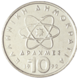
SYMBOL OF THE ATOM

Metallic Composition: Copper 75% Nickel 25% Diameter: 26,00 mm Weight: 7,50 gr. Year of first issue: 1976