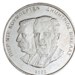
BARON PIERRE DE COUBERTIN DIMITRIOS VIKELAS

Metallic Composition: Copper 75% Nickel 25% Diameter: 28,50 mm Weight: 9,50 gr. Year of first issue: 2000