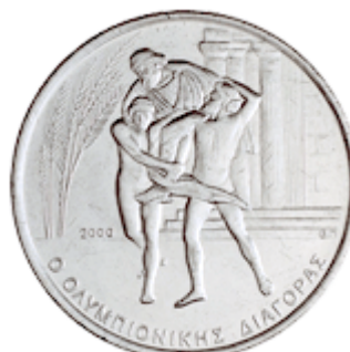
THE OLYMPIC CHAMPION DIAGORAS

Metallic Composition: Copper 75% Nickel 25% Diameter: 28,50 mm Weight: 9,50 gr. Year of first issue: 2000