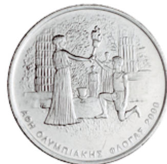
THE OLYMPIC FLAME LIGHTING CEREMONY

Metallic Composition: Copper 75% Nickel 25% Diameter: 28,50 mm Weight: 9,50 gr. Year of first issue: 2000