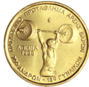
MODERN WEIGHTLIFTING EVENT

Metallic Composition: Copper 92% Aluminium 6% Nickel 2% Diameter: 29,50 mm Weight: 10 gr. Year of first issue: 1999