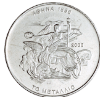
THE COMMEMORATIVE MEDAL OF THE 1896 OLYMPICS

Metallic Composition: Copper 75% Nickel 25% Diameter: 28,50 mm Weight: 9,50 gr. Year of first issue: 2000