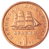
VESSEL OF 1821 "CORVETTE"

Metallic Composition: Copper 99,9% Phosphorous 0,02% Diameter: 18,00 mm Weight: 2,75 gr. Year of first issue: 1988