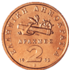
MARITIME SYMBOL OF 1821

Metallic Composition: Copper 99,9% Phosphorous 0,02% Diameter: 21,00 mm Weight: 3,75 gr. Year of first issue: 1988