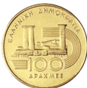
THE TEMPLE OF HERA

Metallic Composition: Copper 92% Aluminium 6% Nickel 2% Diameter: 29,50 mm Weight: 10 gr. Year of first issue: 1997