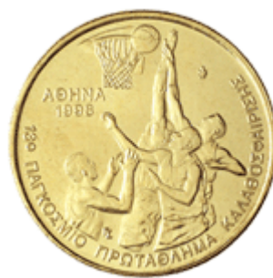
PLAYERS FIGHTING UNDER THE BASKET

Metallic Composition: Copper 92% Aluminium 6% Nickel 2% Diameter: 29,50 mm Weight: 10 gr. Year of first issue: 1998