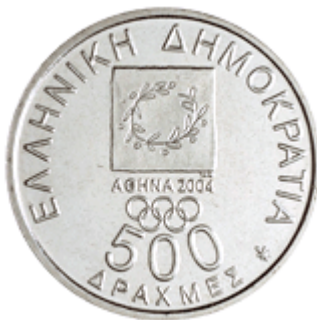
LOGO OF THE ATHENS 2004 OLYMPIC GAMES

Metallic Composition: Copper 75% Nickel 25% Diameter: 28,50 mm Weight: 9,50 gr. Year of first issue: 2000