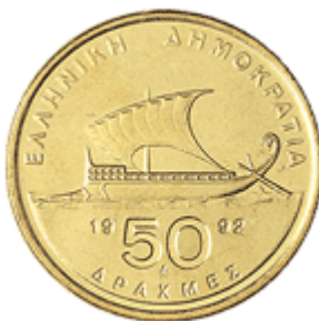
ANCIENT GREEK VESSEL

Metallic Composition: Copper 92% Aluminium 6% Nickel 2% Diameter: 27,50 mm Weight: 9 gr. Year of first issue: 1986