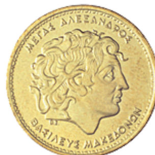
ALEXANDER THE GREAT

Metallic Composition: Copper 92% Aluminium 6% Nickel 2% Diameter: 29,50 mm Weight: 10 gr. Year of first issue: 1990